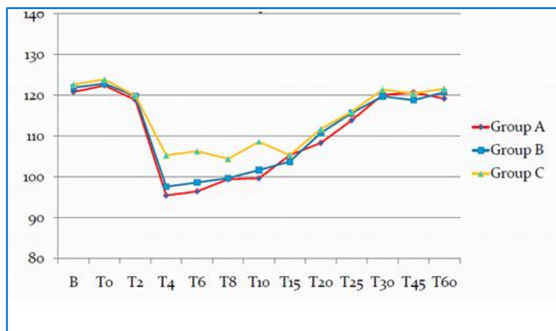
FIG. 1: SYSTOLIC BLOOD PRESSURE